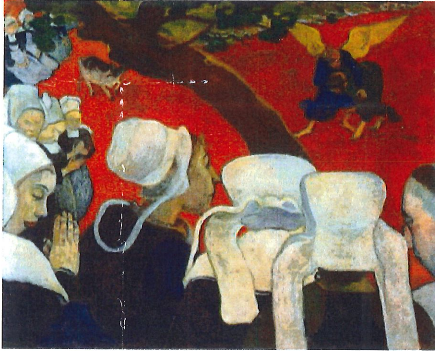
Paul Gauguin, 1888 Scottish National Gallery, Edinburgh