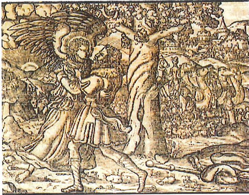
Gutenberg Bible, 1558