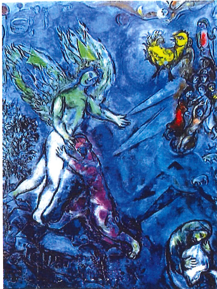
Marc Chagall, 1966 National Museum Marc Chagall, Nice