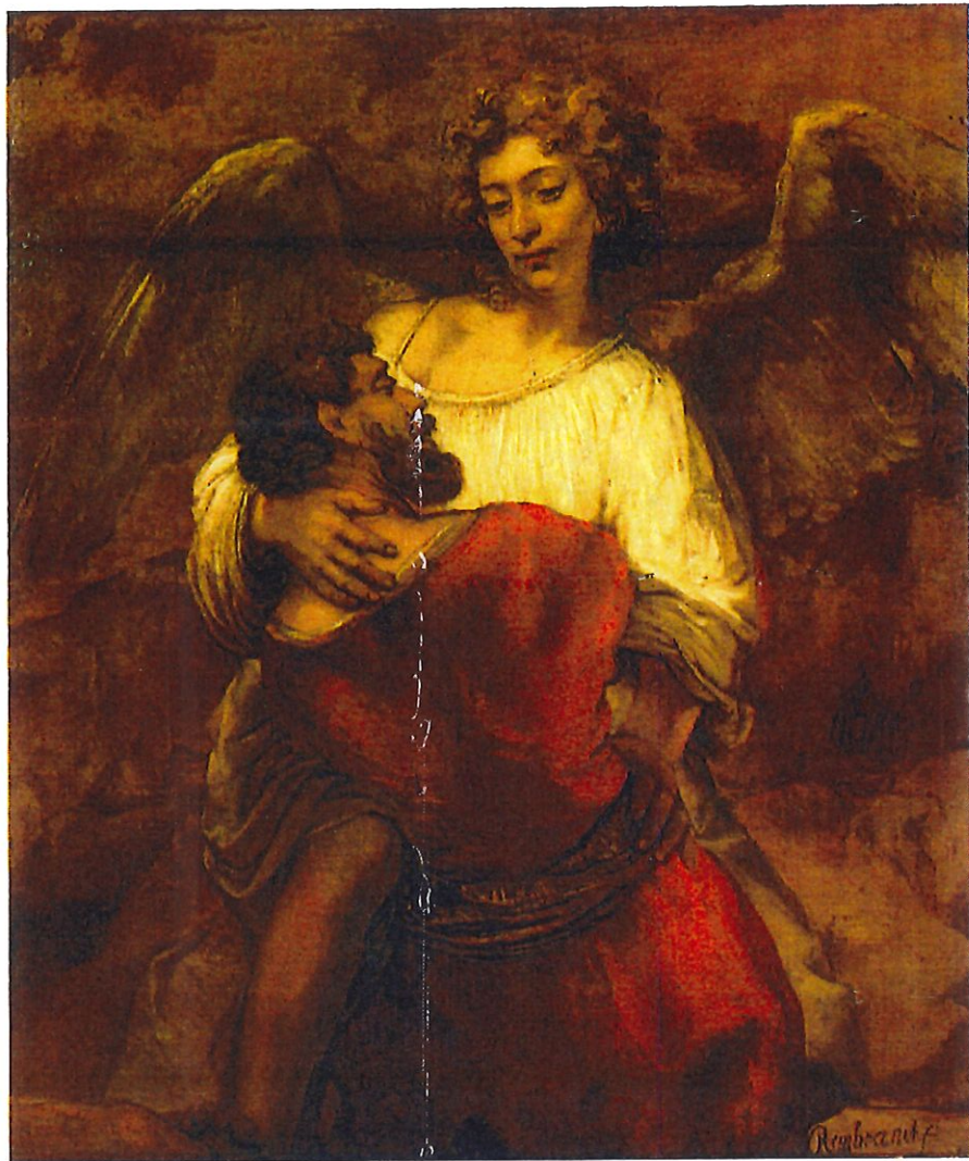
Rembrandt van Rijn, 1659 Gemäldegalerie, Berlin