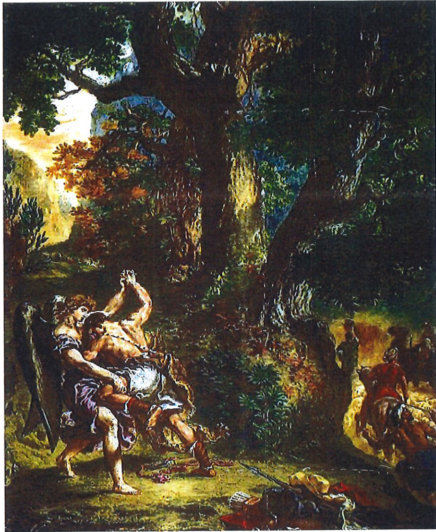
Eugene Delacroix, 1850 The Metropolitan Museum of Art, New York